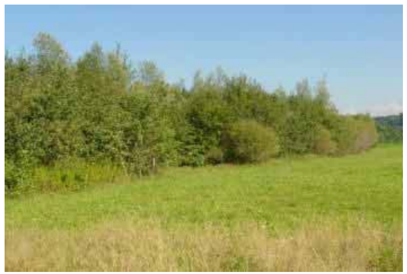
Agriculture and Rural Development @ IEEP